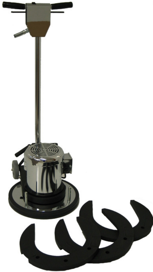
9017-BULL Shown above with optional weights

The Crusader 17" Extreme Duty BULL floor machine is the strongest 115 Volt floor machine on the market. The BULL floor machine has a totally enclosed motor and is ideal for the toughest conditions. This high quality unit is great for using in conditions that have dust, moisture, and chemicals and is great for sanding and screening applications, stone care, and concrete work.