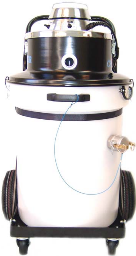
M1050-30-PUMP Shown above

The Crusader 30 Gallon Continuous Pump-out Vacuum is great for pumping outside or to a drain while you continue to work inside. This vacuum can pump while you vacuum, or can pump when your done vacuuming. The pump-out vacuum is great for pumping down one or more flights of stairs instead of trying to wheel a vacuum tank full of heavy liquids down a stairs. Save on workers compensation from employees hurting their backs while lifting heavy containers full of liquids - PUMP IT OUT!