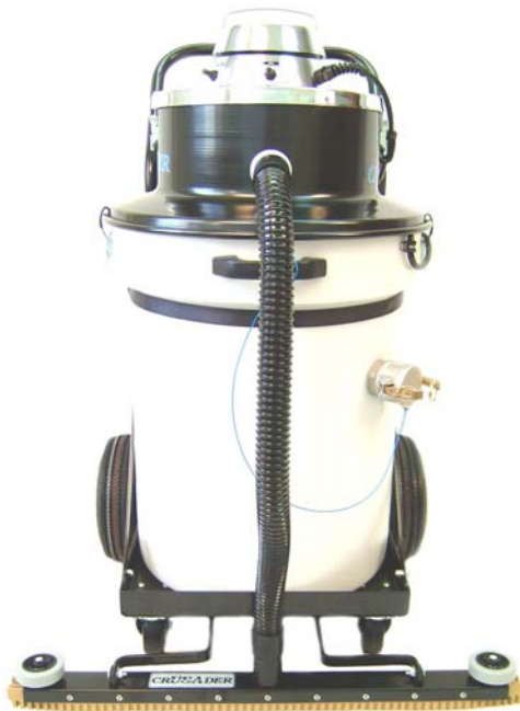
#4017-CART 30 gallon 30" Front Mount Squeegee shown on 30 gallon